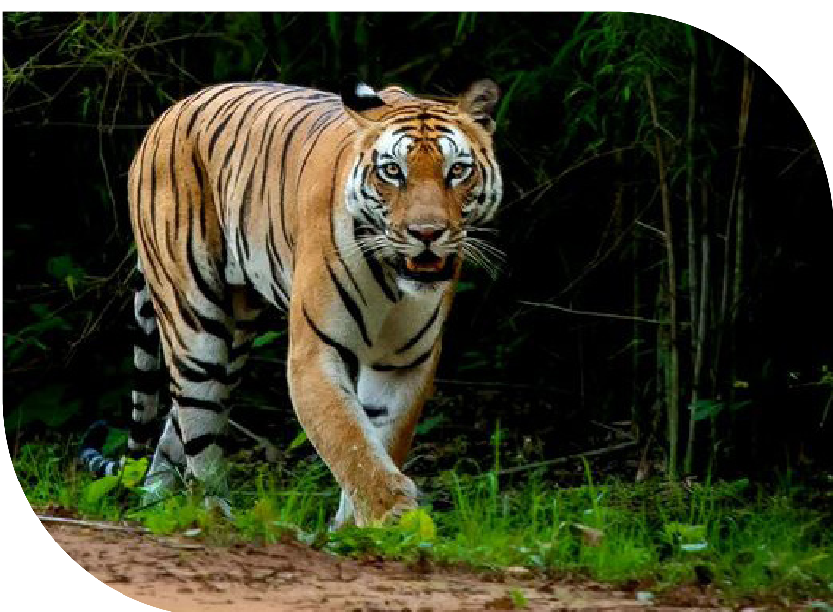
Old Sultanpur (T-13)